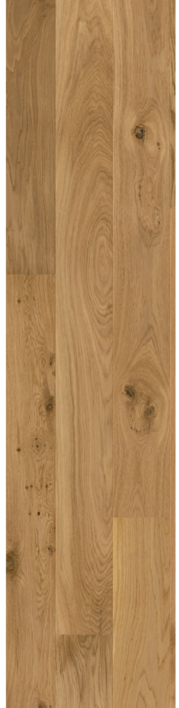
Wintry Forest Oak Extra Matt AMT3845