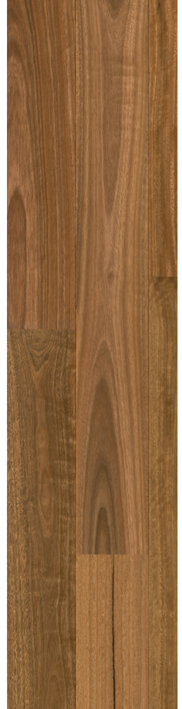
Spotted Gum AMT3859

Matching Scotia QSWSCOT01865 Matching Incizo QSWINCP01865