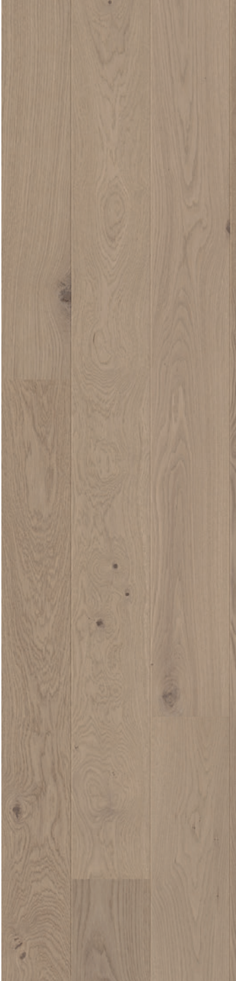
Cliff Grey Oak Extra Matt AMT3850

Matching Scotia QSWSCOT03017 Matching Incizo QSWINCP03017