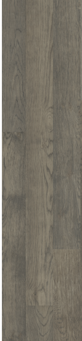
Slate Grey Oak Extra Matt AMT3846

Matching Scotia QSWSCOT03017 Matching Incizo QSWINCP03017