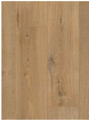
SOFT OAK NATURAL