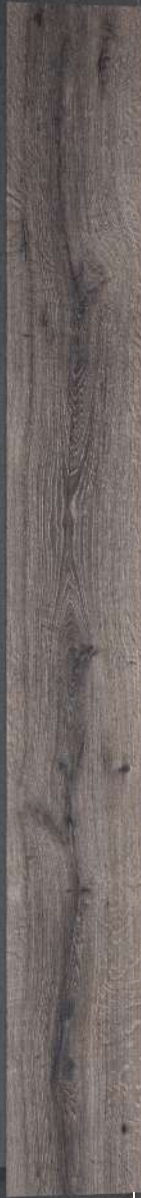
Majestic 205 x 24cm