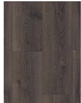
DESERT OAK BRUSHED DARK BROWN

Matching Scotia QSFSCOT03548 Matching Incizo QSINCP03548