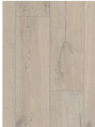
SOFT OAK LIGHT