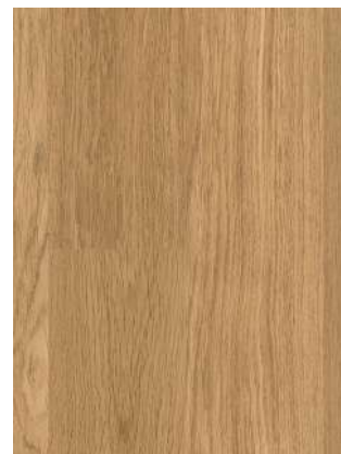
NATURAL VARNISHED OAK

Matching Scotia QSFSCOT01283 Matching Incizo QSINCP01283