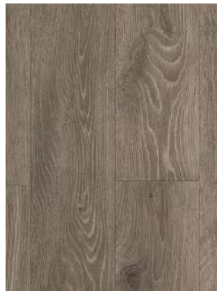
WOODLAND OAK BROWN

Matching Scotia QSFSCOT03552 Matching Incizo QSINCP03552