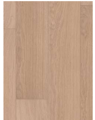
WHITE VARNISHED OAK