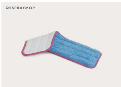
CLEANABLE MICROFIBRE MOP

Mop holder with water tank and handy lever to easily moisten and mop your floor. Also includes a cleanable microfiber mop and one-litre of Quick-Step cleaning product.