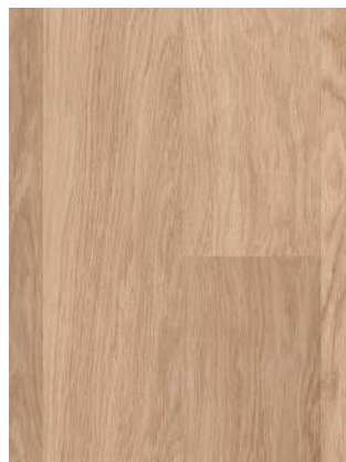
WHITE VARNISHED OAK

Matching Scotia QSFSCOT01304 Matching Incizo QSINCP01304