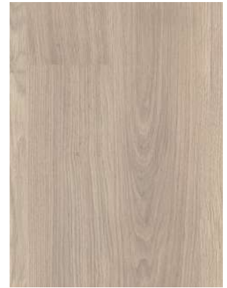
LIGHT GREY VARNISHED OAK

Matching Scotia QSFSCOT03574 Matching Incizo QSINCP03574