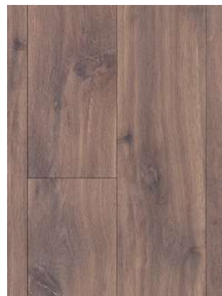
MIDNIGHT OAK BROWN

Matching Scotia QSFSCOTAU01487 Matching Incizo QSINCP01487