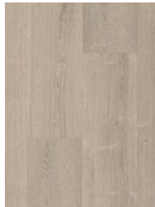
BRUSHED OAK BEIGE

Matching Scotia QSSCOT04752 Matching Incizo QSINCP04752