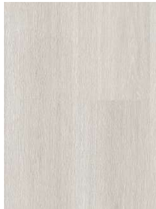
ESTATE OAK LIGHT GREY