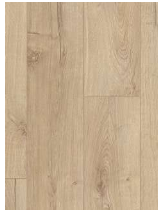
CLASSIC OAK BEIGE