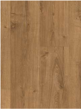
CLASSIC OAK NATURAL