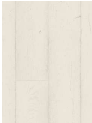
PAINTED OAK WHITE