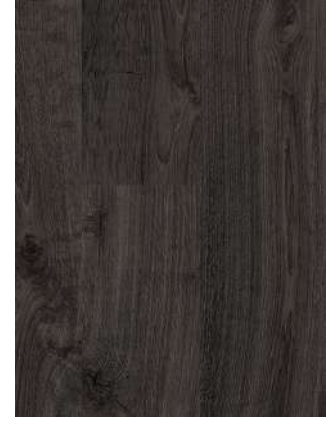
NEWCASTLE OAK DARK

Matching Scotia QSFSCOT04446 Matching Incizo QSINCP04446