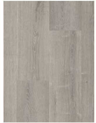
BRUSHED OAK GREY

Matching Scotia QSSCOT04748 Matching Incizo QSINCP04748