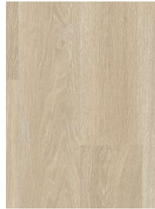
ESTATE OAK BEIGE

Matching Scotia QSFSCOT03573 Matching Incizo QSINCP03573