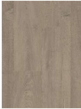
PATINA OAK BROWN

Matching Scotia QSSCOT04762 Matching Incizo QSINCP04762