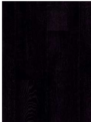
PAINTED OAK BLACK

Matching Scotia QSSCOT04756 Matching Incizo QSINCP04756