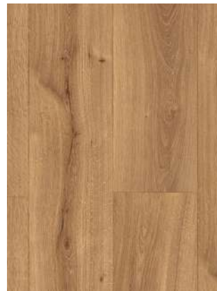
DESERT OAK WARM NATURAL

Matching Scotia QSFSCOT03805 Matching Incizo QSINCP03805