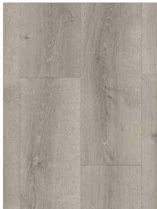
DESERT OAK BRUSHED GREY

Matching Scotia QSFSCOT04446 Matching Incizo QSINCP04446