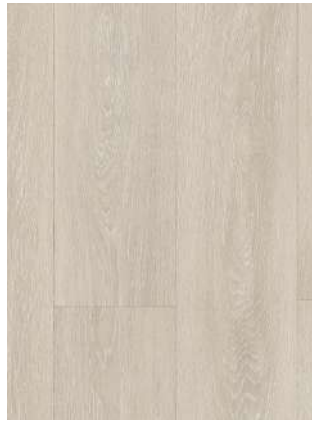
VALLEY OAK LIGHT BEIGE