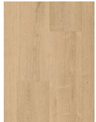
BRUSHED OAK NATURAL

Matching Scotia QSSCOT04764 Matching Incizo QSINCP04764