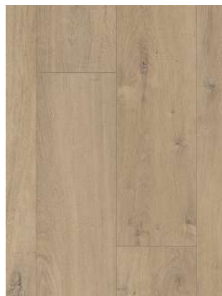
SOFT OAK MEDIUM