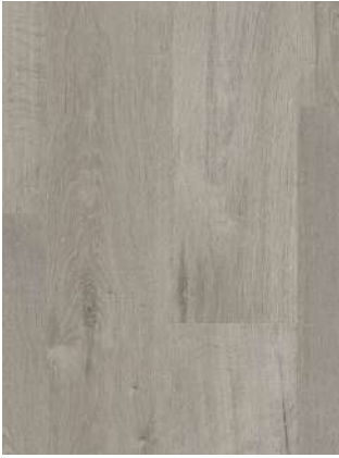
SOFT OAK GREY