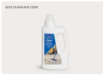
CLEANING PRODUCT 1L