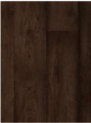
WAXED OAK BROWN

Matching Scotia QSSCOT04760 Matching Incizo QSINCP04760