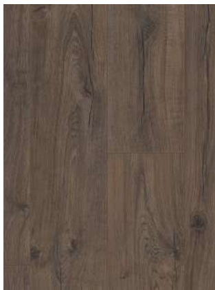
CLASSIC OAK BROWN