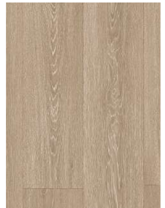
VALLEY OAK LIGHT BROWN

Matching Scotia QSFSCOTAU00896 Matching Incizo QSINCP00896