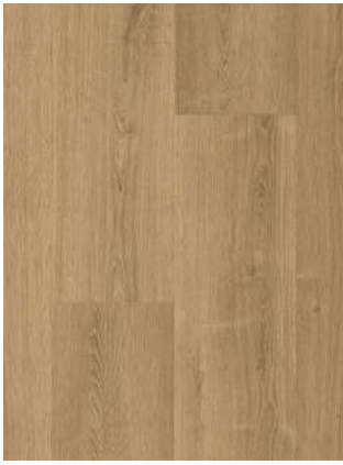
BRUSHED OAK WARM NATURAL