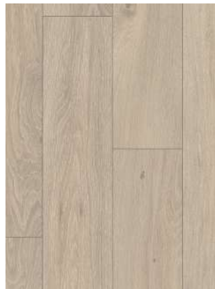
MOONLIGHT OAK LIGHT