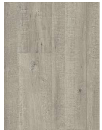
SAW CUT OAK GREY