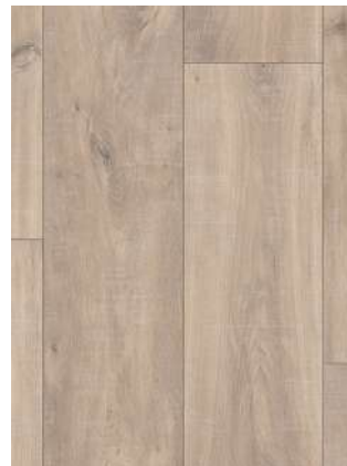
HAVANNA OAK NATURAL WITH SAW CUTS

Matching Scotia QSFSCOT01658 Matching Incizo QSINCP01658