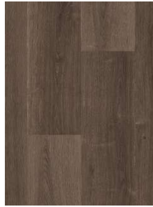
BRUSHED OAK BROWN

Matching Scotia QSSCOT04751 Matching Incizo QSINCP04751