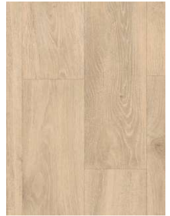
WOODLAND OAK BEIGE

Matching Scotia QSFSCOT03550 Matching Incizo QSINCP03550