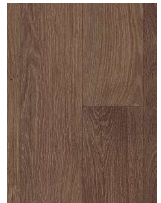
LIGHT GREY OILED OAK

Matching Scotia QSFSCOT01488 Matching Incizo QSINCP01488