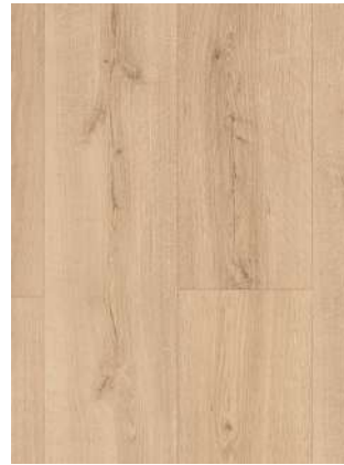
DESERT OAK LIGHT NATURAL

Matching Scotia QSSCOT01854 Matching Incizo QSINCP01854