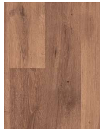
VINTAGE OAK NATURAL VARNISHED

Matching Scotia QSFSCOTAU00896 Matching Incizo QSINCP00896