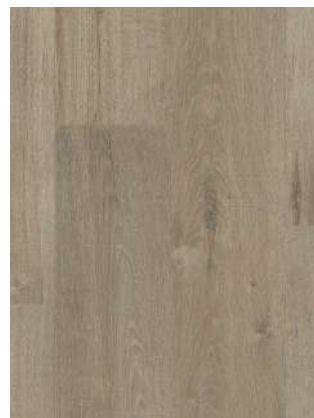
SOFT OAK LIGHT BROWN