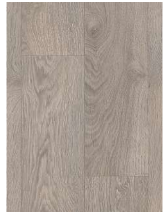
OLD OAK LIGHT GREY

Matching Scotia QSSCOT01656 Matching Incizo QSINCP01656