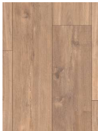
MIDNIGHT OAK NATURAL

Matching Scotia QSSCOT01405 Matching Incizo QSINCP01405