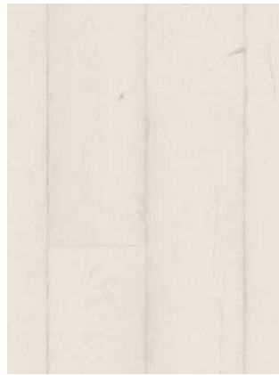
PAINTED OAK WHITE