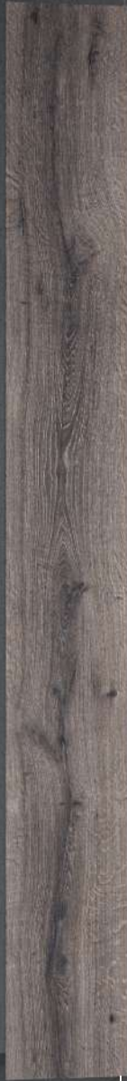
Majestic 205 x 24cm