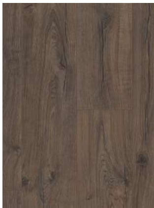
CLASSIC OAK BROWN