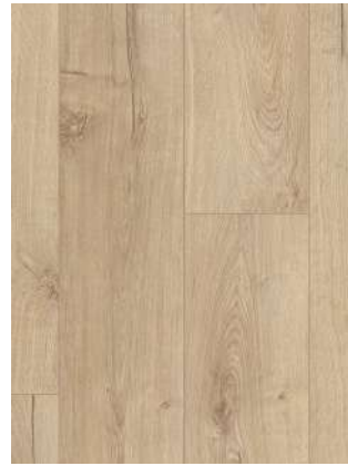
CLASSIC OAK BEIGE