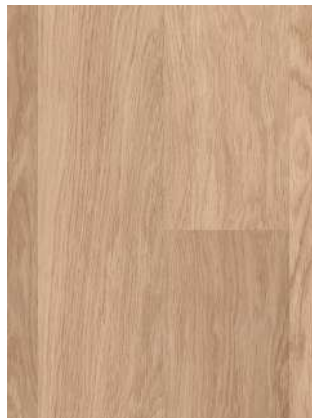
WHITE VARNISHED OAK

Matching Scotia QSFSCOT01304 Matching Incizo QSINCP01304