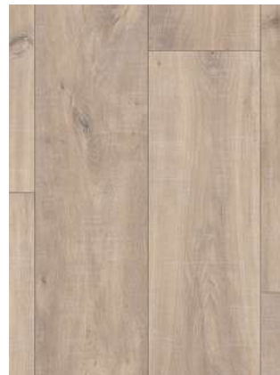
HAVANNA OAK NATURAL WITH SAW CUTS

Matching Scotia QSFSCOT01658 Matching Incizo QSINCP01658