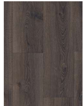
DESERT OAK BRUSHED DARK BROWN

Matching Scotia QSFSCOT03548 Matching Incizo QSINCP03548