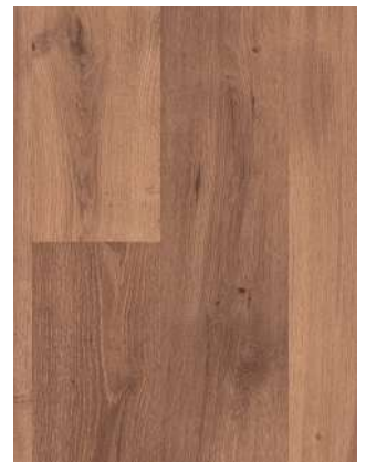
VINTAGE OAK NATURAL VARNISHED

Matching Scotia QSFSCOTAU00896 Matching Incizo QSINCP00896