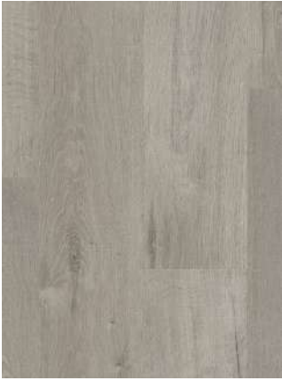
SOFT OAK GREY