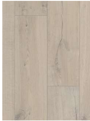
SOFT OAK LIGHT