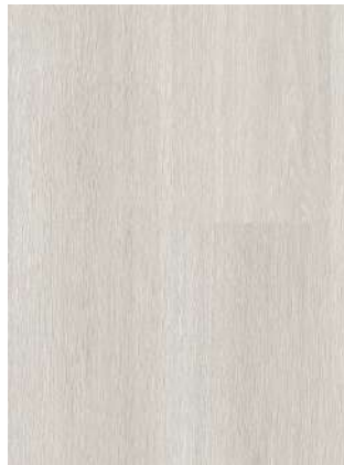
ESTATE OAK LIGHT GREY