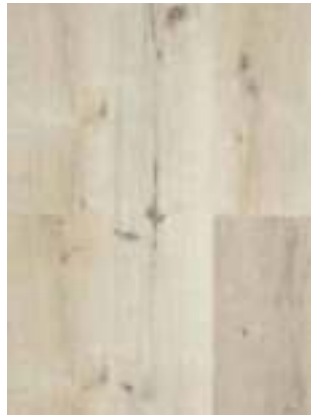
✓ Coney Island