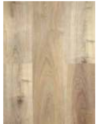
✓ Staten Island