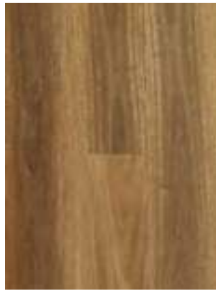
• Spotted Gum