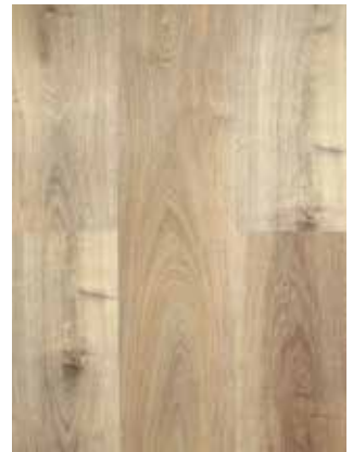
✓ Staten Island