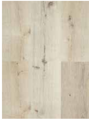
✓ Coney Island