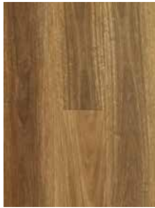
• Spotted Gum